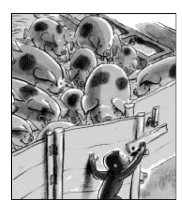
The pigs are