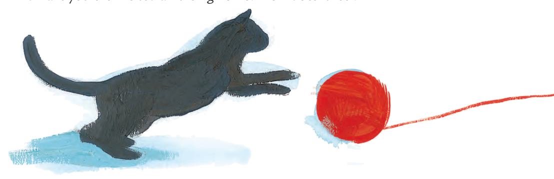
Illustration © Vali Mintzi from The Girl with a Brave Heart