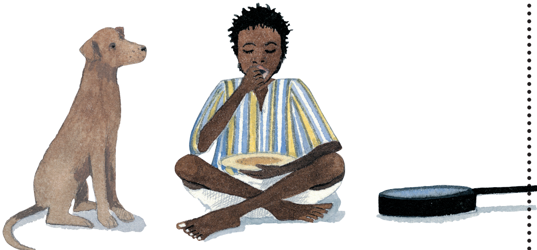
from Mama Panya's Pancakes