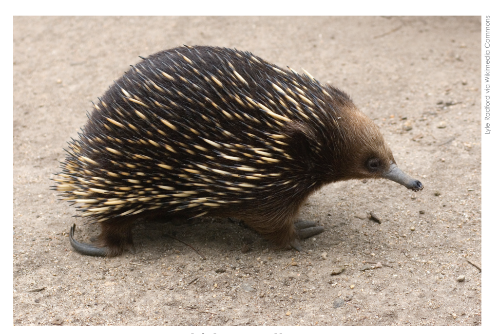
An echidna on the move