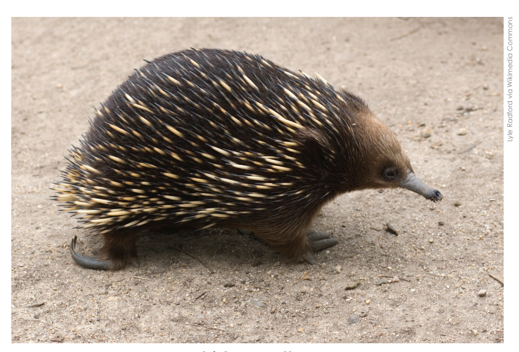
An echidna on the move

A mammal is a kind of animal. It has warm blood. It has hair. It gives birth to live babies. It feeds milk to its babies.