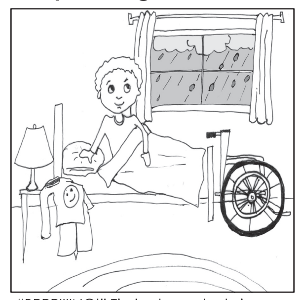
"BRRRIIIING!" Tim's alarm clock rings. Time to wake up. Tim sits up in bed and looks outside. What a gray, rainy day. Dark clouds hide the sun. There is too much rain this spring. Tim can't wait for summer.