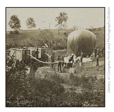
Filling a hot air balloon on the battlefield

Each hot air balloon was tethered to the ground by a long rope to keep the balloon from flying away in the wrong direction. A pilot took the balloon up 500 feet. He looked around and wrote down what the Southern troops were doing. When he was done, the pilot took the balloon back down and reported to the army leaders what he saw. Now the army leaders knew what to expect from the Southern army. They knew how far away the enemy was. They knew how many men the enemy had. They could use this information to make better plans for how to fight the enemy. This helped the North win the war.