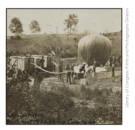
Filling a hot air balloon on the battlefield

Each balloon was held to the ground by a long rope. This kept the balloon from flying away. A pilot took the balloon up 500 feet. He looked around. He wrote down what the Southern troops were doing. The balloon went down. The pilot told the army leaders what he saw. This helped them fight the South. It helped the North win the war.