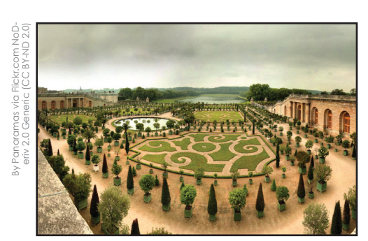
A garden at Versailles

Versailles is likely the best-known castle in all of France. It is located near Paris. It was not built as a fortress. It was built as a palace. It was meant to be a place where the king could live. Versailles is luxurious and beautiful both inside and out. King Louis XIV made this palace the center of his kingdom in 1682. King Louis XIV loved beauty. He wanted only the finest clothing, art, music, and gardens in his palace. The palace has 2,300 rooms and spreads over nearly 40 square miles of land. This includes its many gardens, fountains, and various buildings. Today the castle is a museum. About five million people visit the palace every year. Between eight to ten million walk through the castle's gardens each year. This makes it the most visited castle in all of France.