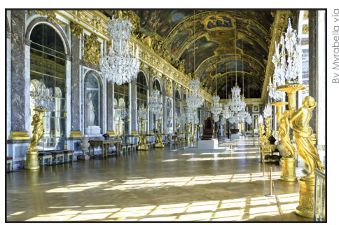
Inside Versailles: the Hall of Mirrors