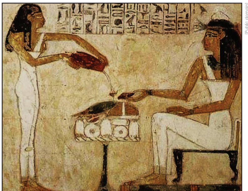
Egyptian hieroglyphics appear at the top of the picture

Egyptian writing is called hieroglyphics. Hieroglyphics use simple pictures called glyphs. The glyphs stand for different words. To read hieroglyphics, you must know the meaning of each glyph. The writing you are reading right now uses letters to form words. The letters come from an alphabet. Each letter makes a sound. You can put different letters together to form words. The letters form the sounds of the words we speak. The Greeks used an alphabet to write, too.