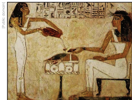
Egyptian hieroglyphics appear at the top of the picture

Egyptian hieroglyphics are a special form of writing that use simple pictures called glyphs. The glyphs stand for different words and in order to read hieroglyphics, you must know the meaning of each glyph. The writing you are reading right now uses letters to form words. The letters come from an alphabet and each one