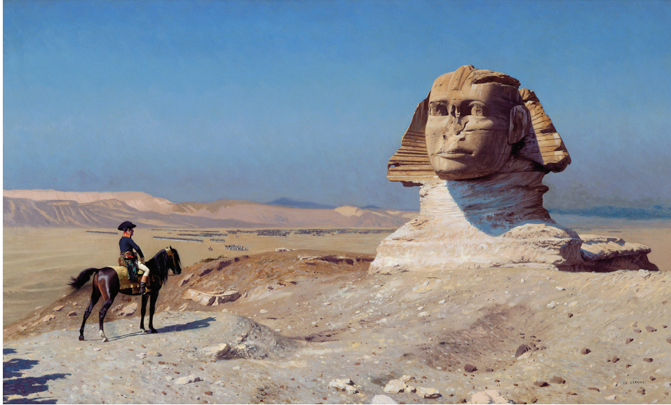
A painting by Jean-Léon Gérôme (Public domain)