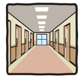
ward: a part of a hospital where patients stay